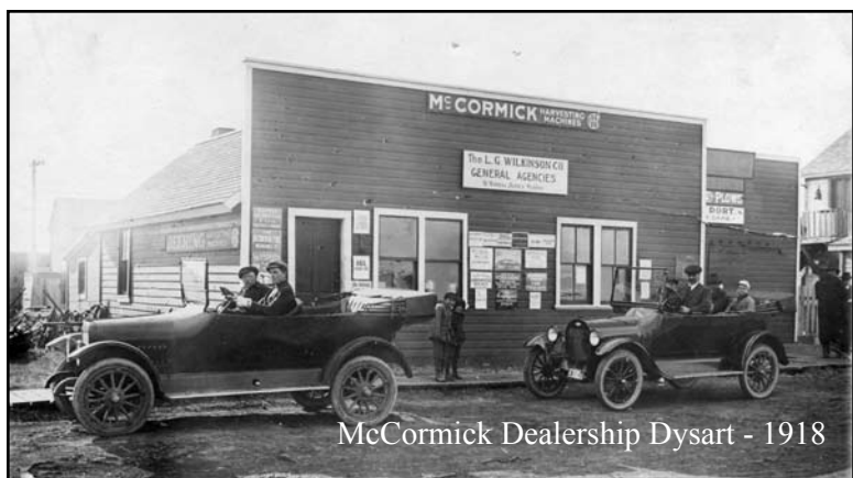
McCormick Dealership Dysart - 1918