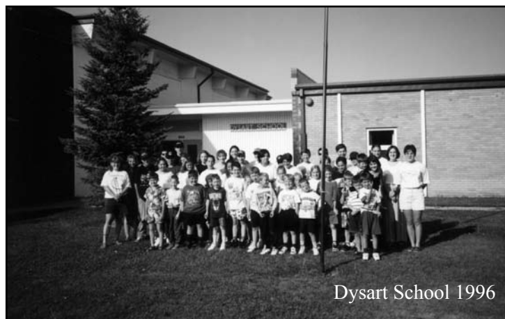
Dysart School 1996