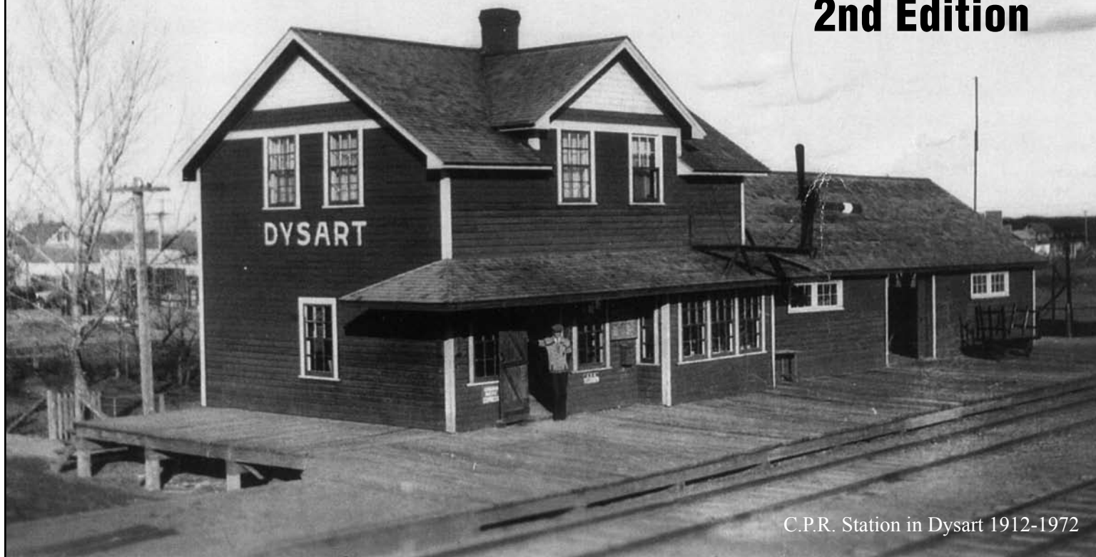
C.P.R. Station in Dysart 1912-1972