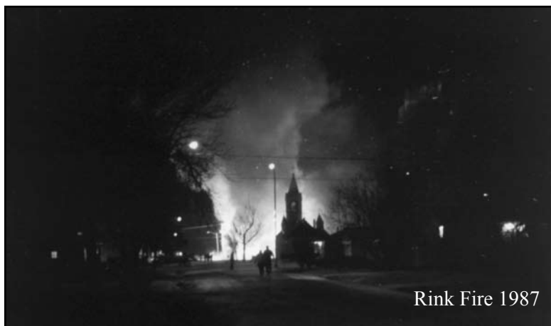
Rink Fire 1987